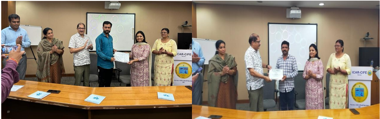
Certificate distribution to Participants