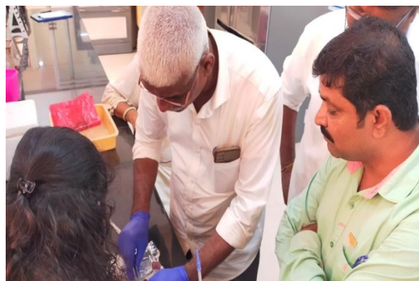
Hands-on practice of dissection fish