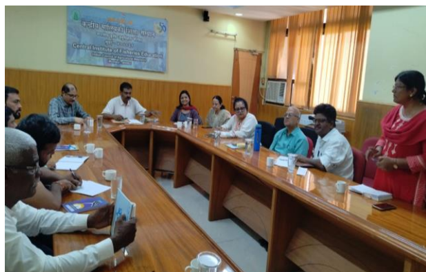
Inauguration of workshop